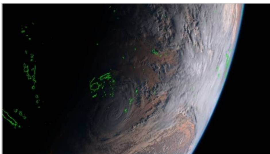
HIMAWARI 8 SATELLITE

The cyclone is currently picking up speed and heading toward the southern-most islands of Fiji, although it is unlikely that the main islands will be affected.